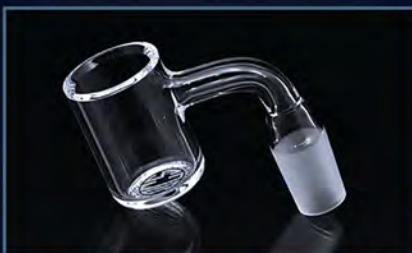
25mm Quartz Banger • 14mm • 90° Also available in Female