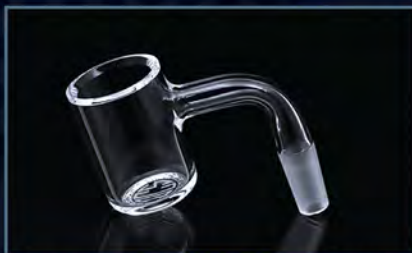
25mm Quartz Banger • 10mm • 90° Also available in Female