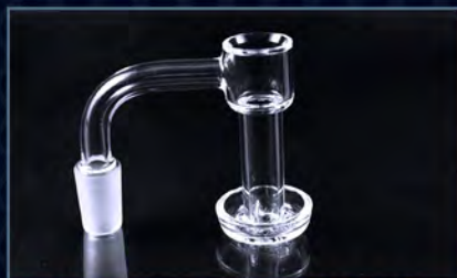
Long Quartz TS • 10mm • 45° & 90° Also available in Female