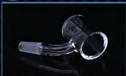
25mm Quartz Banger • 10mm • 45° Also available in Female