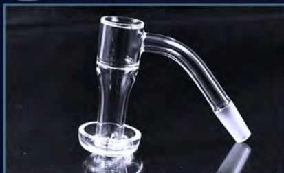
Vortex Quartz TS • 10mm • 45° & 90° Also available in Female