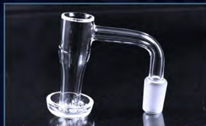
Vortex Quartz TS • 14mm • 45° & 90° Also available in Female

All DCS Bangers & TS Quartz Bangers come with Beveled Tops for Better Performance Custom engraving also available on all DCS Bangers & TS Quartz Bangers