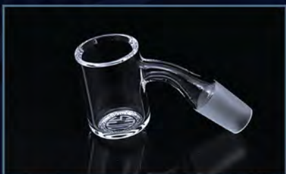
25mm Quartz Banger • 14mm • 45° Also available in Female