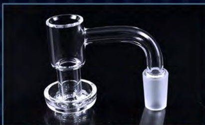
Standard Quartz TS • 14mm • 45° & 90° Also available in Female