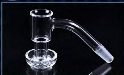
Standard Quartz TS • 10mm • 45° & 90° Also available in Female