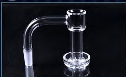
Long Quartz TS • 10mm • 45° & 90° Also available in Female